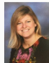
Jo Woodland Foundation Governor