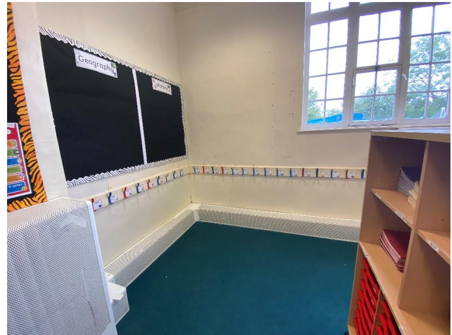
Our cloakroom and pegs.