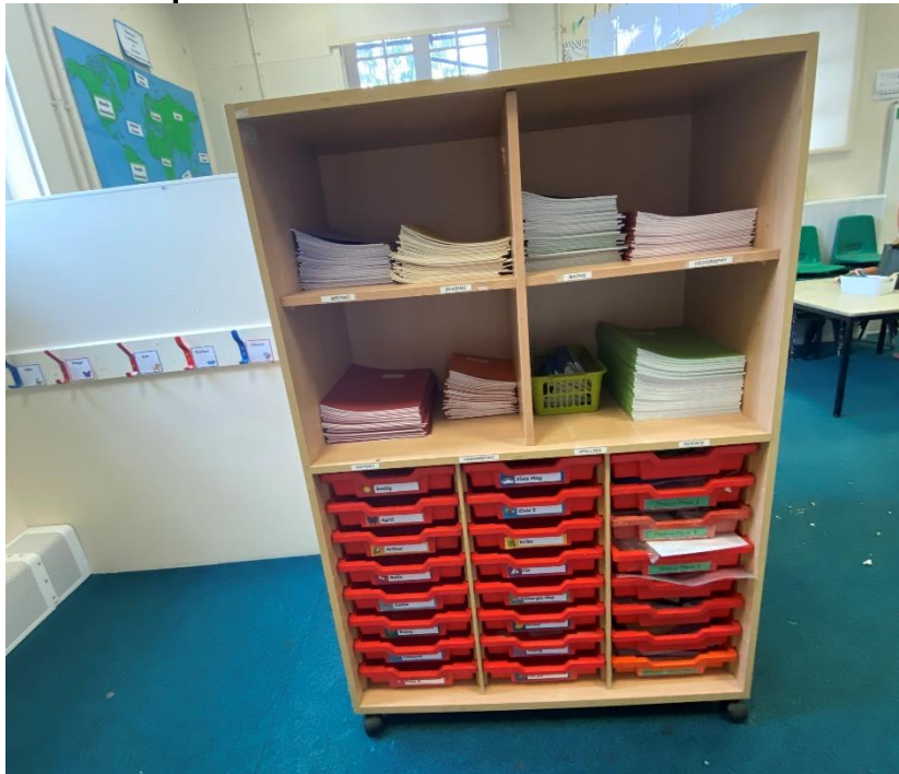
Our named trays.

We keep our things tidy and can access what we need easily. Things in Year One are labelled and easily accessed, giving us independence.